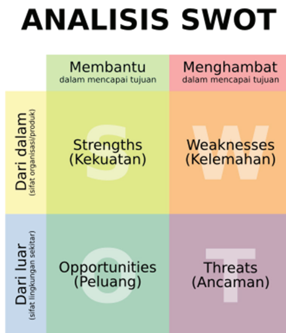
Figure 1. SWOT analysis framework.

SWOT is an acronym for strengths, weaknesses, opportunities, and threats in a project or business venture. These four factors form the acronym SWOT.